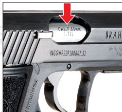
2. Fig. 1

Locate the cartridge designation marked on the firearm. This information indicates the ammunition that must be used in this firearm (see 2. Fig. 1). You are responsible for selecting ammunition that meets industry standards and is appropriate in type and caliber for this firearm. Never use a cartridge not specifically designated for use in your firearm. Pressure from the wrong type of ammunition may exceed the capability of your firearm and may damage or even rupture your firearm.