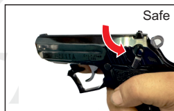
4. Fig. 6