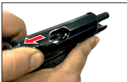
4. Fig. 2

NOTE: In normal operation, when the slide is released from the open position and is allowed to return to the fully closed position with the decocking safety lever in the down (SAFE) position (as shown in 4. Fig. 2), the hammer will fall against the decocking safety body.