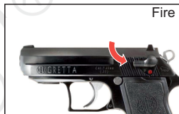
4. Fig. 5