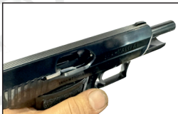
4. Fig. 3