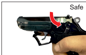
(7.2. Fig. 1).

• Rotate the safety decocking lever fully down into the (SAFE) position (7.2. Fig. 1). This action will decock the hammer allowing it to fall against the decocking safety body.